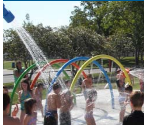
Splash pad beside Northside Pool