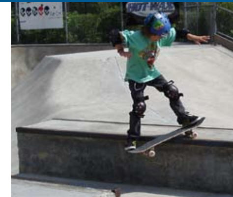
Greenfield Grind Skatepark