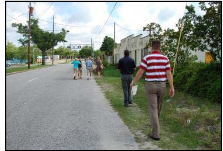
Residents and staff walk along S. 5th Avenue during a walking tour of the SouthSide study area.