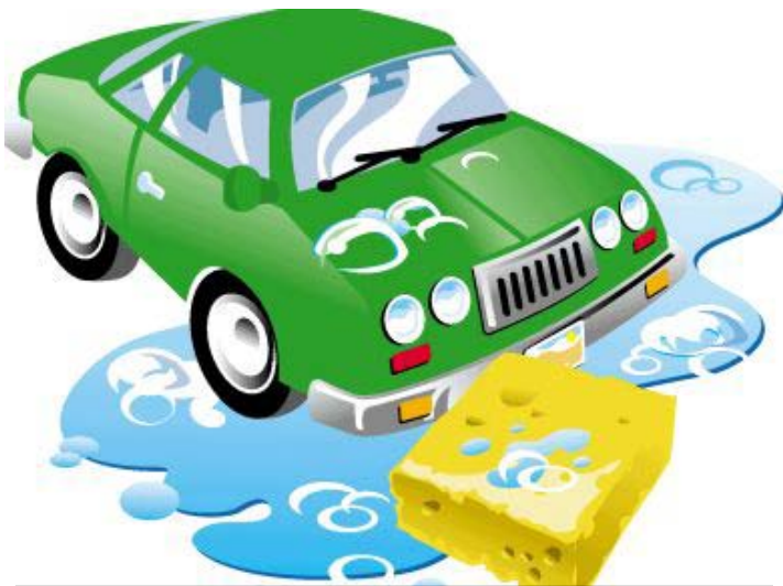
Soap from washing Cars